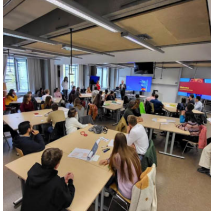
TUMJA Selection Days 2023