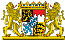
Bayerisches Landesamt für Gesundheit und Lebensmittelsicherheit