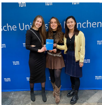
Taskforce Mentoring at the Vivat TUM Concert