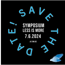
Save the date!