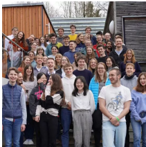
The new TUMJA #class24