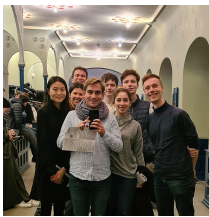
TUMJA goes Kammerspiele