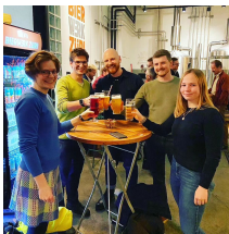
TUMJA in Zürich