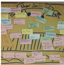
Workshop of team Erik*a