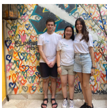
TUMANYwords in Sao Paulo