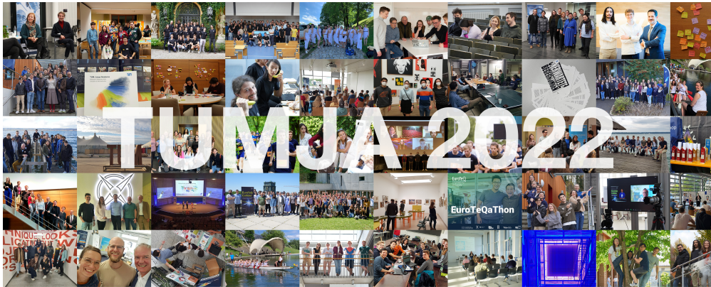
Rückblick auf 2022