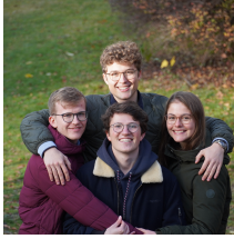
Team Membrains in Wartaweil