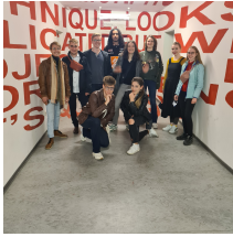
Visit to the Kunstlabor during the Lange Nacht der Museen