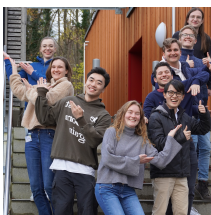
Team CheckMate in Wartaweil