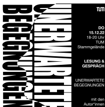
Reading on 15 Nov