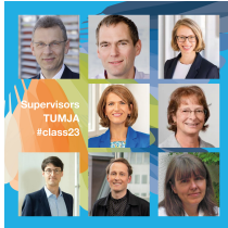
Supervisors of #class23