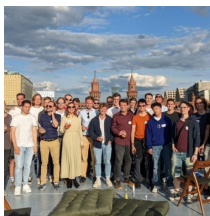
New economic partner QuantCo