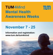
Awareness Weeks Mental Health by TUM4Mind