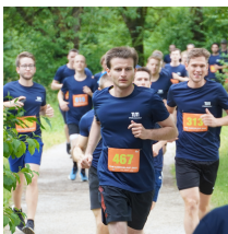
Thanks to all participants and volunteers!