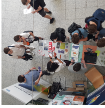
Our booth at the IKOM.