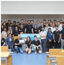
We were happy to welcome 57 participants this year.