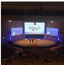
The live event was held at TUM Audimax in Munich.