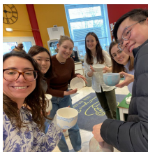
Tick Talkers Team