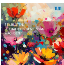
Writing Workshop "Stilblüten"