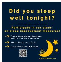
Somnoactive is looking for participants!