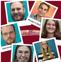
Active TUMJA members as well as alumni are involved in the Selection Days.