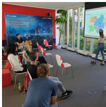
TUMJA Industrial Partner Pixida GmbH