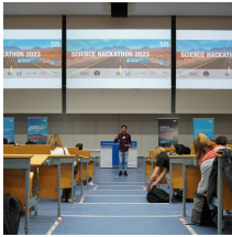
TUMJA Science Hackathon