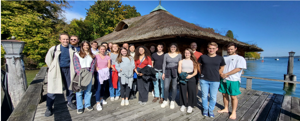
TUMJA Weekend Seminar in October 2023