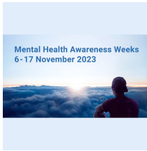
TUM4Mind: Mental Health Awareness Weeks