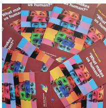
Application Flyers for TUMJA #class24