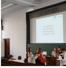
TUMJA Mentoring: Kick-Off and Closing Event in June 2023