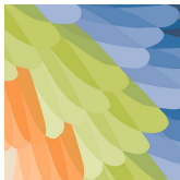
TUMJA Year 2021