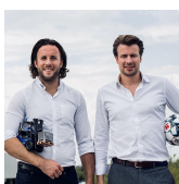
TUM start-up Kinexon facilitates