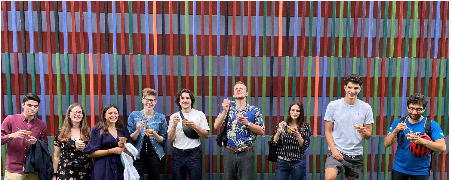
Team Exfluenced: Team-building with icecream