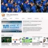
TUMJA Youtube Channel - check it out!