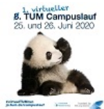
The second edition is following in November!