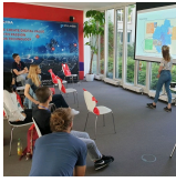
Two student research teams at Pixida GmbH Headquarter