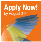
The application process for the next year's cohort is open.